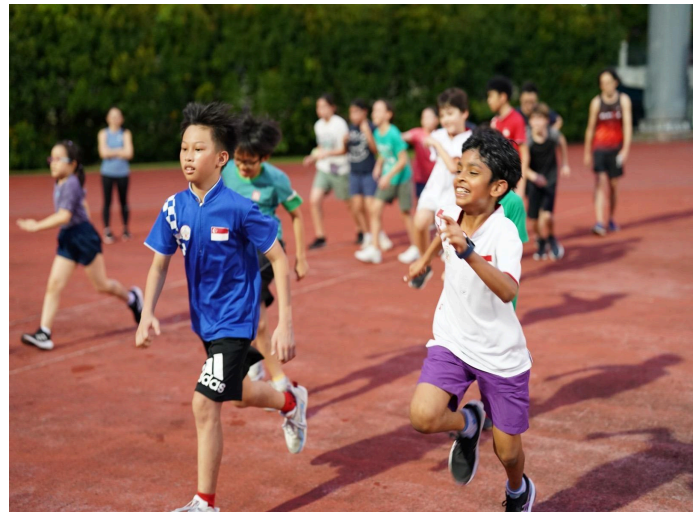
Weekly physical conditioning

The Singapore Chess Federation reserves the right to amend the selection criteria for the National Training Programme depending on the number of entries in each category. Such changes, if any, will be announced prior to the commencement of the first round.