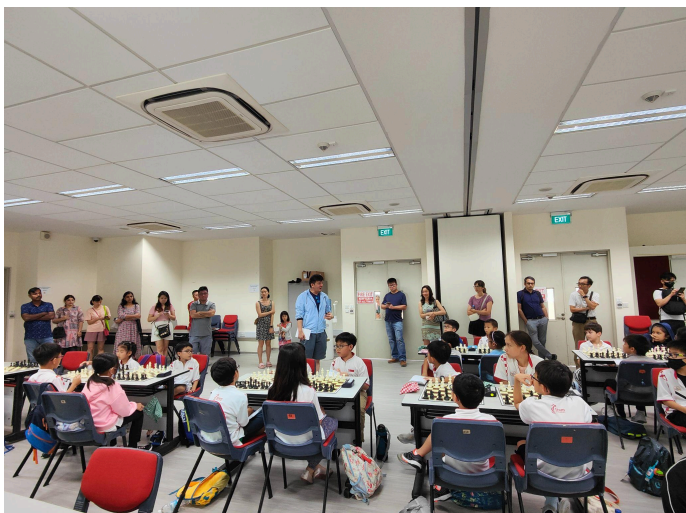
Regular training games

List of qualified participants for the various squads will be published on Google Sheets and announced after the tournament. This will also be published on Chess Results.