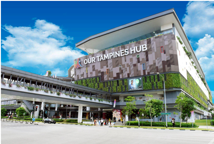
Our Tampines Hub facade

Our Tampines Hub, 1 Tampines Walk, Singapore 528523 Level 3 Auditorium