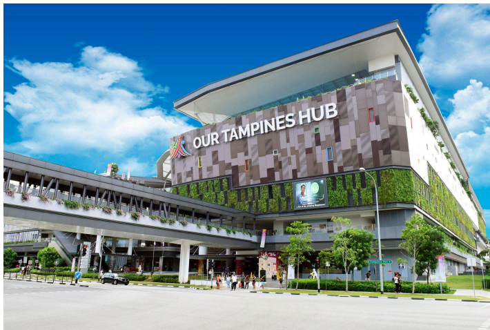
Our Tampines Hub facade

Our Tampines Hub, 1 Tampines Walk, Singapore 528523 Level 3 Auditorium