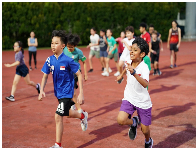
Weekly physical conditioning

The Singapore Chess Federation reserves the right to amend the selection criteria for the National Training Programme depending on the number of entries in each category. Such changes, if any, will be announced prior to the commencement of the first round.