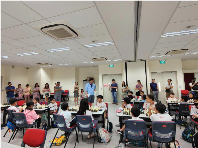
Regular training games

List of qualified participants for the various squads will be published on Google Sheets and announced after the tournament. This will also be published on Chess Results.