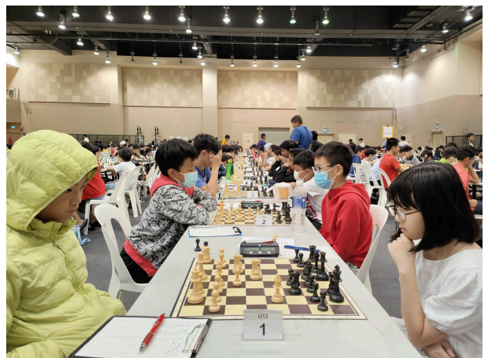
Scenes from NAG 2023